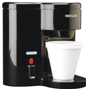
Jerdon Style CM12B 1-Cup Coffeemaker